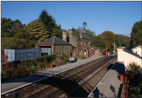
Goathland Station is familiar to millions of television viewers as the fictional 'Aidensfield' in the hugely popular 'Heartbeat'.