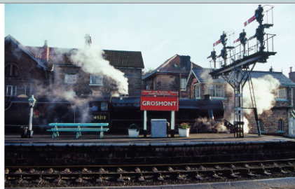
In April 2007 history was made when the railway commenced running through trains from Pickering to Whitby becoming the first preserved railway allowed to operate passenger trains on the national railway network. On many operating days it is no longer necessary to 'change' at Grosmont.