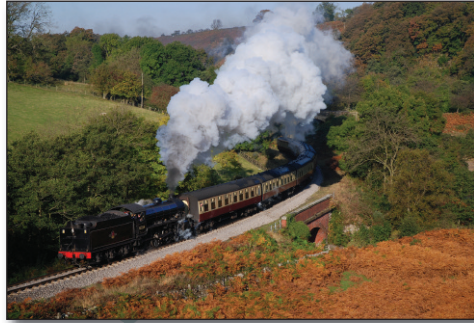
A favourite location for photography is Darnholm where the early morning trains capture the light perfectly. B1 No. 61264 rounds the curve on 20 October 2007.