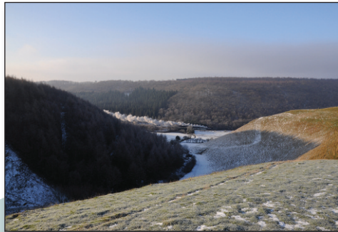
The railway viewed from Cross Dale as a Santa Special heads for Levisham.