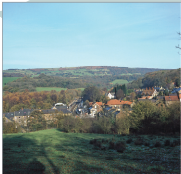
Grosmont is the northern terminus of the preserved railway. The footbridge crosses the Esk Valley line to the left of the N1WR platforms.