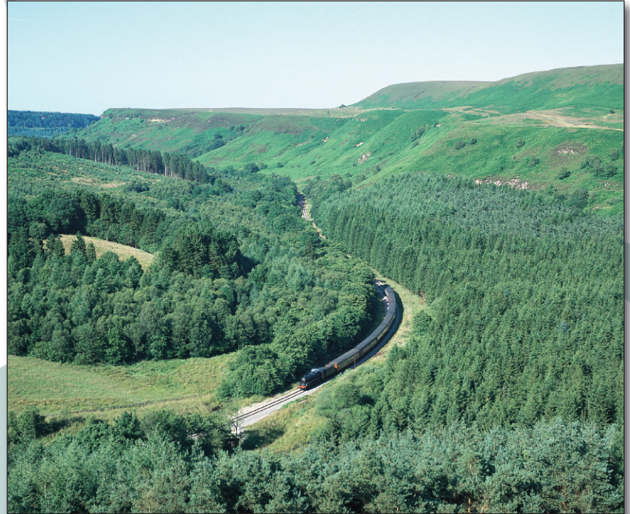
The view from Skelton Tower must be one of the best on any railway.