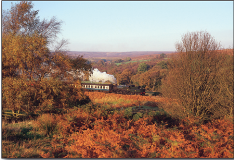
The autumn colours were as vibrant as ever in October 2007 as No. 75029 passes across the scene. (Karl Heath)