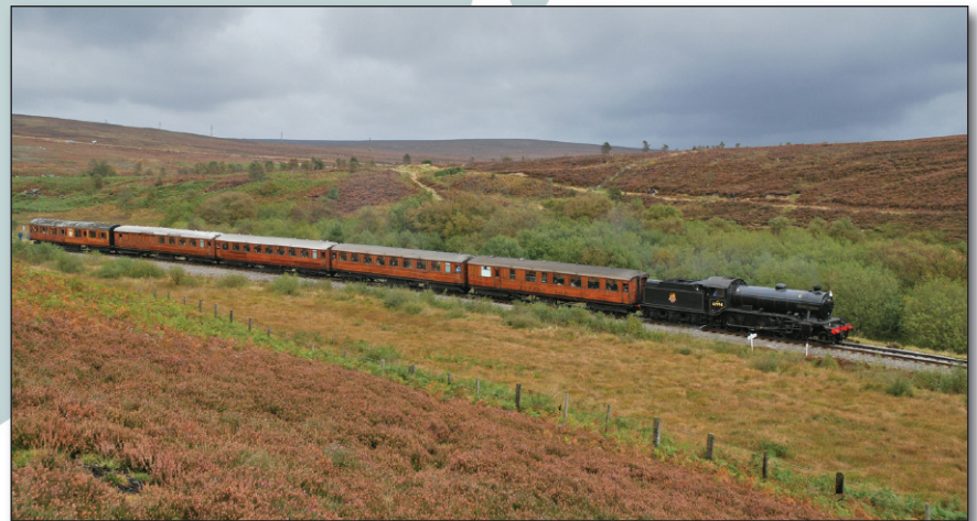
Passing over the line's summit at Fen Bog is 'The Great Marquess' on an overcast 28 September 2007.